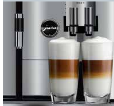
Variable dual spout with 2 coffee spouts and 2 milk spouts