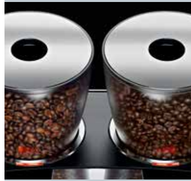
2 professional ceramic disc grinders