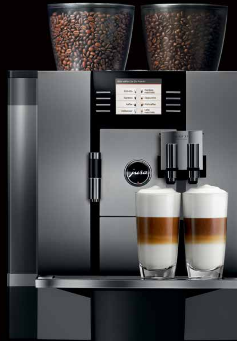
GIGA X7 Professional

With a wide selection of accessories including an interface for accounting systems, as well as an attractive range of storage and presentation units, it is possible to create a complete coffee solution tailored to your specific requirements.