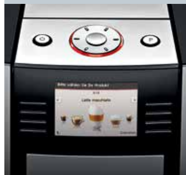
Rotary Switch and TFT display for maximum speed