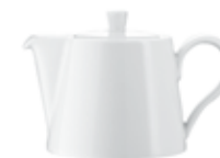
Jug (12 oz) 2 minutes 30 seconds